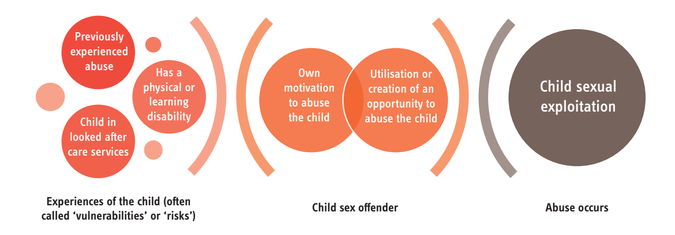
Figure 3.1: The relationship between vulnerabilities, risks and CSE (Eaton, forthcoming)

Figure 3.1 demonstrates that experiences (risks or vulnerabilities) of the child may or may not be present, but it is only in the presence of a child sex offender that these experiences may have a relationship with CSE.